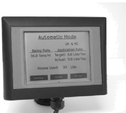
Cab Terminal (006-4670)

Feel free to call or email any questions or concerns. info@harvesttec.com 800-635-7468 ext 0